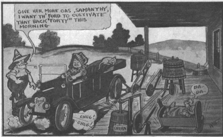
FIG. 3.—Postcard showing alternative uses of the Model T on the farm.

Several accessory manufacturers took advantage of the car's interpretative flexibility and began to commercialize it. Although firms brought out kits to convert the car into a stationary source of power as early as 1912, advertisements for these kits—and others to convert the car into a tractor—did not appear in large numbers until 1917, during wartime shortages of farm labor and horses. Some companies simply sold a pulley to be attached to a jacked-up wheel, but most kit manufacturers realized that jacking up one wheel put an undue strain on the differential gear as one wheel is turning while the other is stationary on the ground. 61 Most kits, therefore, were designed to overcome the problem with the differential. Scientific American described a kit in 1917 that avoided wearing out the differential gear by jacking up both sides of the car and taking power directly from the axle. The Lawrence Auto Power Company in St. Paul, Minnesota, advertised a $35 kit that would take power directly from the crankshaft in the front of a car without having to jack up the car. The company claimed that the device—consisting of a tie-rod, two pulleys, and a metal stand—could operate a feed grinder, corn sheller, silo filler, wood saw, and cream separator. From 1917 to 1919 many