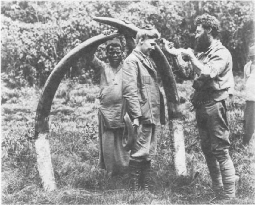
Figure 3. The Christening.