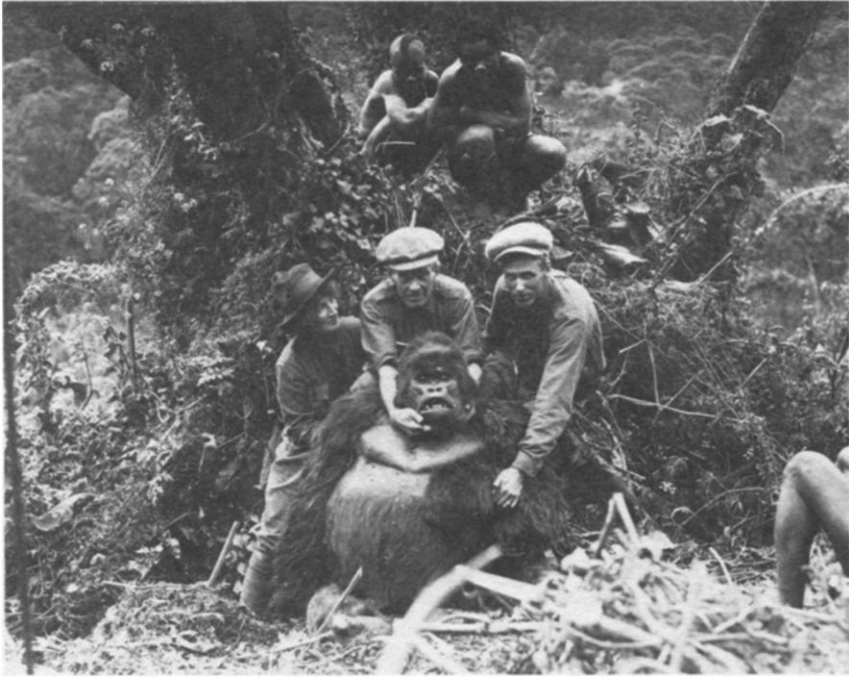
Figure 2. Gorilla shot by H.E. Bradley.