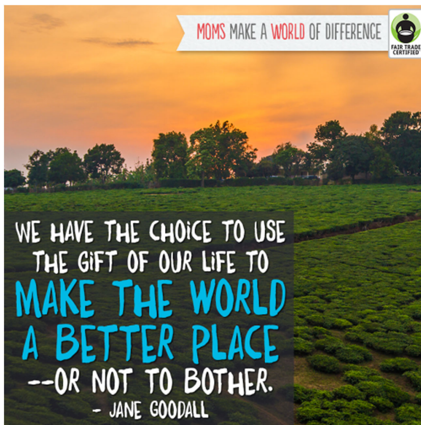
Figure 1: Fair Trade USA Tumblr post from 30 April 2014. Reproduced with permission of Fair Trade USA 2

Fair Trade USA's advertising campaigns since its secession from FLO have nearly all been aimed at convincing consumers that "Every Purchase Matters", even on plantations (see Fair Trade USA 2011a). Advertisements and social media posts share thoughts on consumption from the classic to the celebrity, from Gandhi to John Quincy Adams to Natalie Portman. Take the image shown here from a Mother's Day campaign (Figure 1). Fair Trade USA allows consumers to separate conditions of production from modes of production. As coffee or tea move from farm to cup, its certification model guarantees (or, more accurately, claims to guarantee) that workers earn good wages in non-exploitative environments. By promoting regulatory fairness in farms of all sizes, this model excuses consumers from