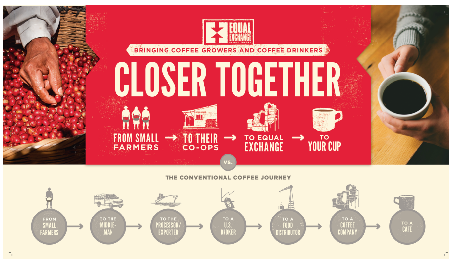
Figure 2: Equal Exchange’s representation of coffee commodity chains. Reproduced with permission of Equal Exchange 4

In the case of tea, however, Equal Exchange’s visualization of the commodity chain obscures the deep entanglements between cooperatives and plantations. Not all